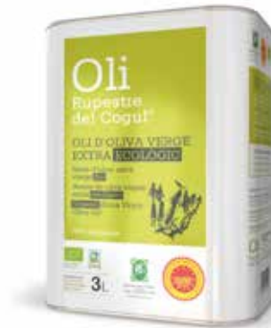
3 liters · ECO