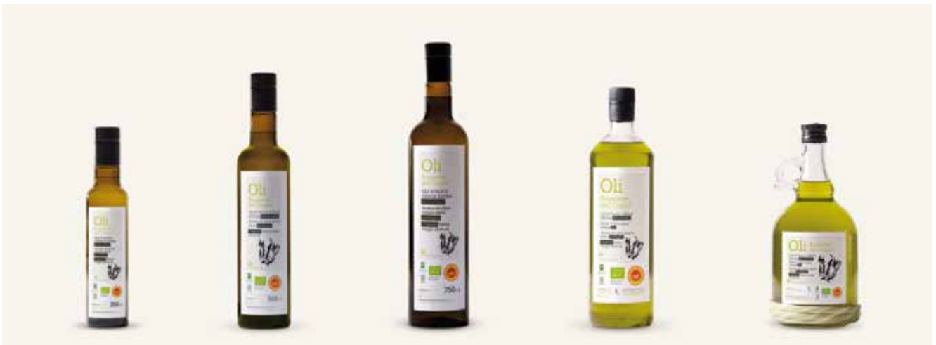
25 cl · ECO