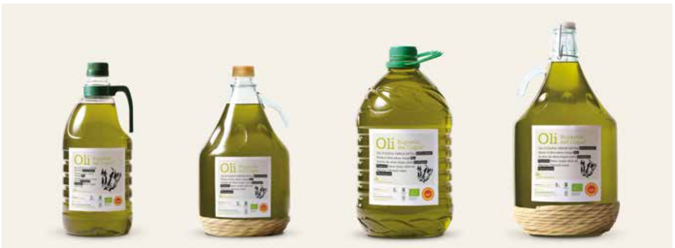
2 litres · ECO