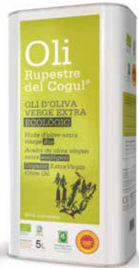
5 liters · ECO